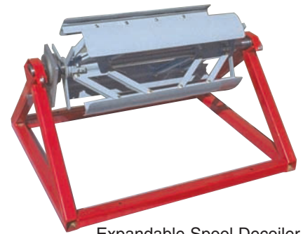
Expandable Spool Decoiler

Form Both 12" & 16" Wide Panels 304 Stainless Steel Tooling Industrial Grade Hydraulic System Notching Hydraulic Shear For Easy Assembly 4,000 lb. Capacity Expandable Decoiler With Brake & Stand Stiffening Ribs Limit Switch Measuring Device Hand Held Remote Controls